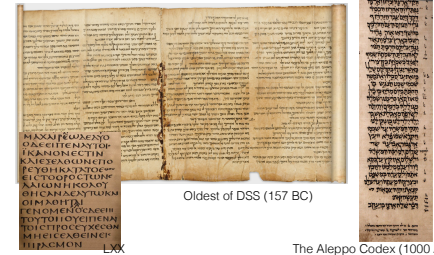
Oldest of DSS (157 BC)